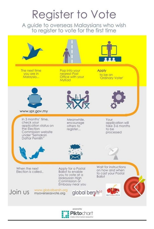
Figure 4. Malaysia: voter registration targeting voters living overseas