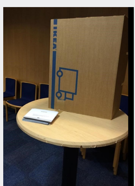
Figure 3. Provisional polling station, Swedish Embassy in London, 2014