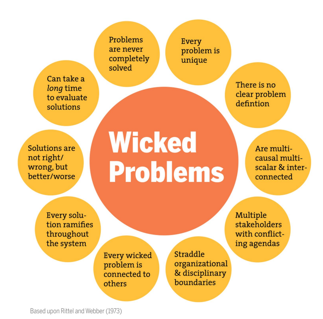
Figure 2. Wicked problems