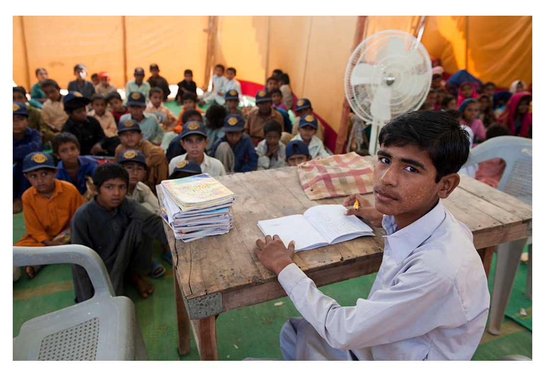
Photo: National flood emergency response in Pakistan during the 2009 floods.