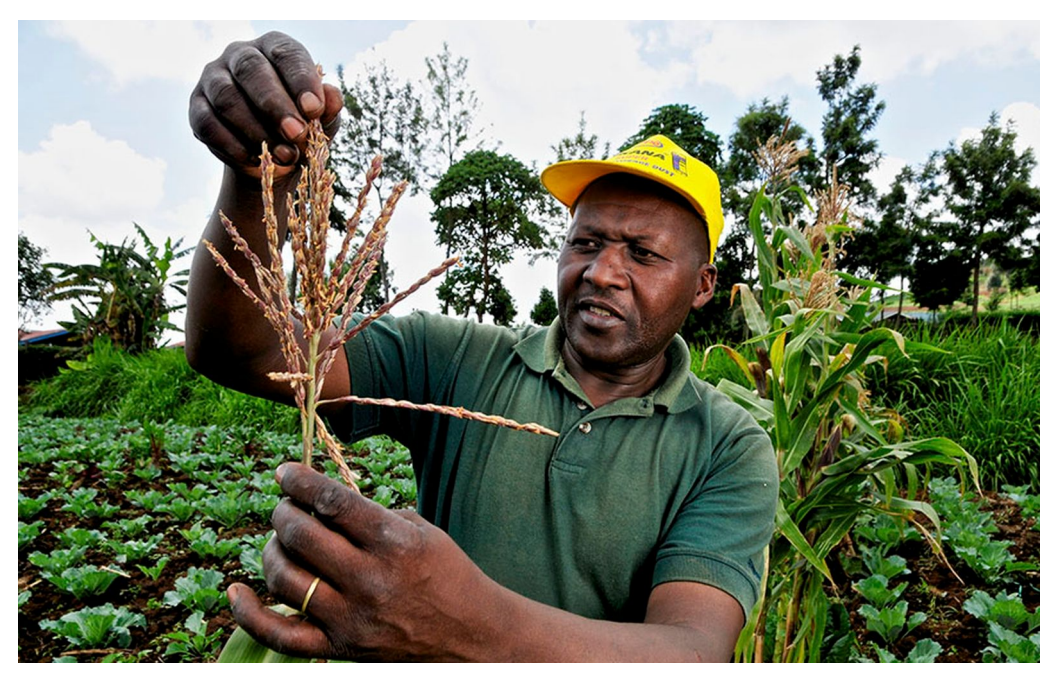
Photo : Maize farming at Mount Kenya region as part of a project preparing farmers for the impact of climate change on agriculture.