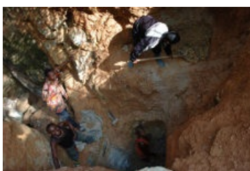
Men at a mine in Kailo, Democratic Republic of the Congo.

An integral part of our #DemocracyMatters campaign comes in the form of op-eds from subject experts, including an article due shortly from best-selling author Prof. James A Robinson (Harvard University).