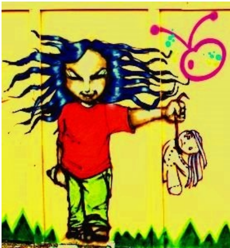
Graffiti Feminista, Fim do feminino