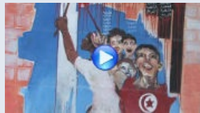
After the Revolution - Building a Democracy in Tunisia (2012)