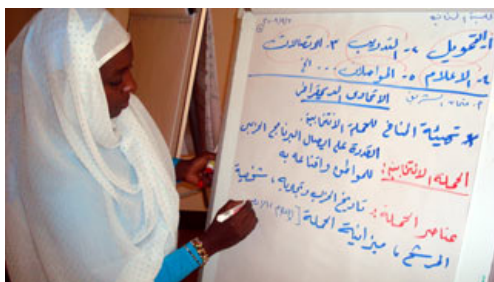
Electoral campaigns training workshop in Sudan, run by IDEA.