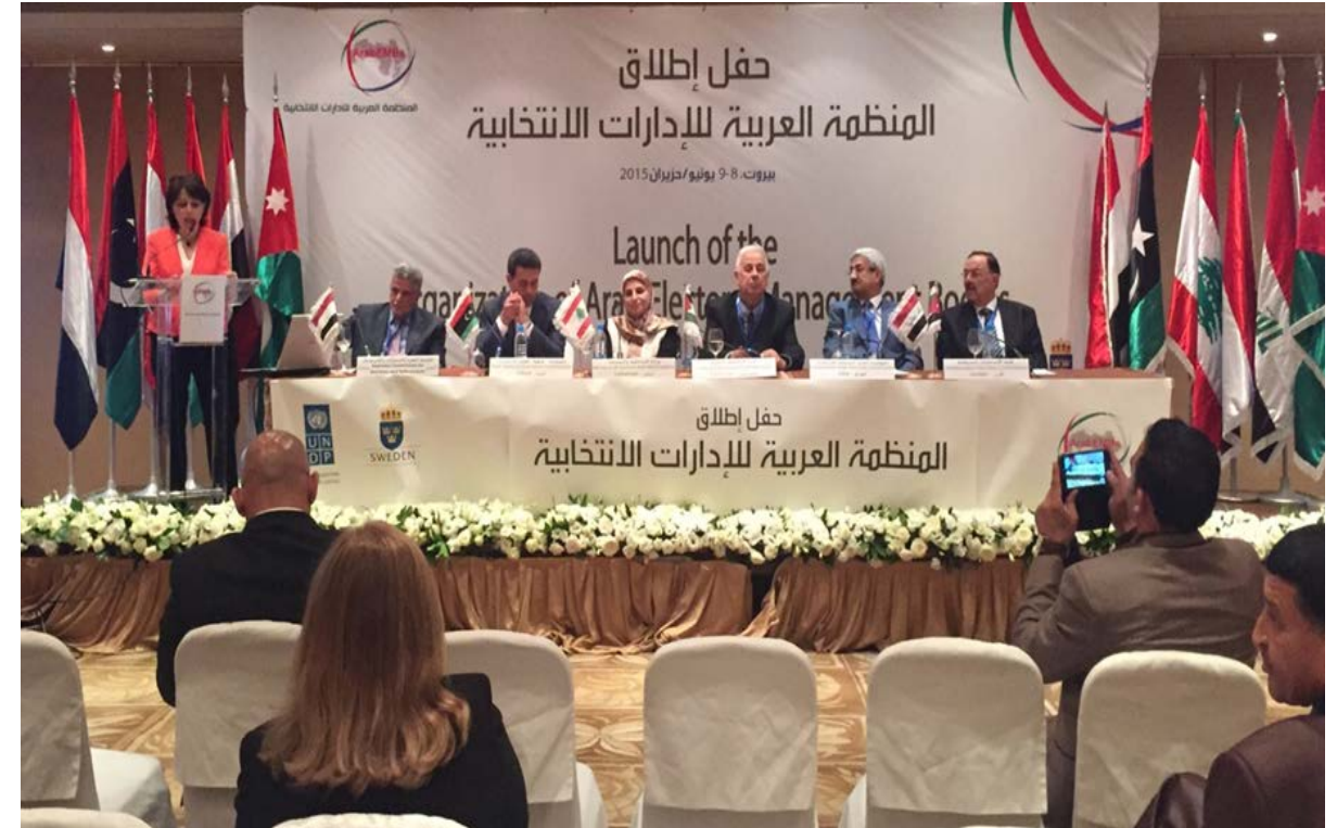
Launching Ceremony 2015