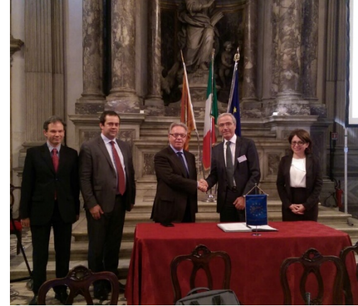
MOU with Venice Commission