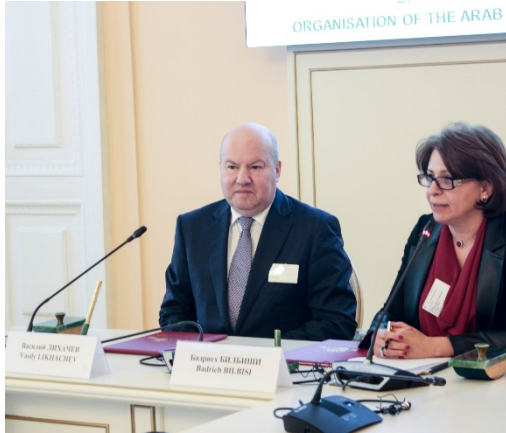
MOU with CEC Russia