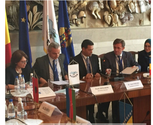
MOU with ACEEEO