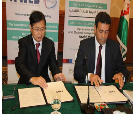
MOU with A-WEB