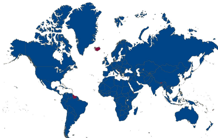
Figure 2.1. Spatial coverage of International IDEA's Global State of Democracy Indices, 2019