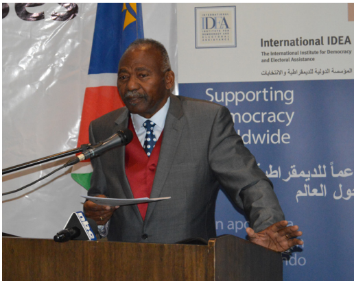
Professor Peter Katjavivi, Speaker of the Namibia National Assembly

Katjavivi also claimed that there is a growing demand for public funding of opposition political parties in Africa. This, he observed, recalls the need for political parties to be held accountable when they disburse public funds for their activities. He underscored that each country has to consider several local factors when developing a model for public funding of political parties. Four components are key to any model. First, it is critical that each political party and candidate is required to submit financial statements. Second, the financial statements must have sufficient information on money flows, such as donations. Third, there must be a mandate for an independent review of these accounts. For this purpose, an independent institution may have to be created to review the financial statements of political parties and candidates, and investigate infractions, which must be punished by sanctions. Fourth, as part of transparency, it may be necessary to require political parties and candidates to make their financial statements public in a user-friendly manner. Recognizing that many values may be at stake in seeking to regulate political campaign financing, countries should consider developing policy enforcement frameworks informed by standards of ethics, transparency and accountability.