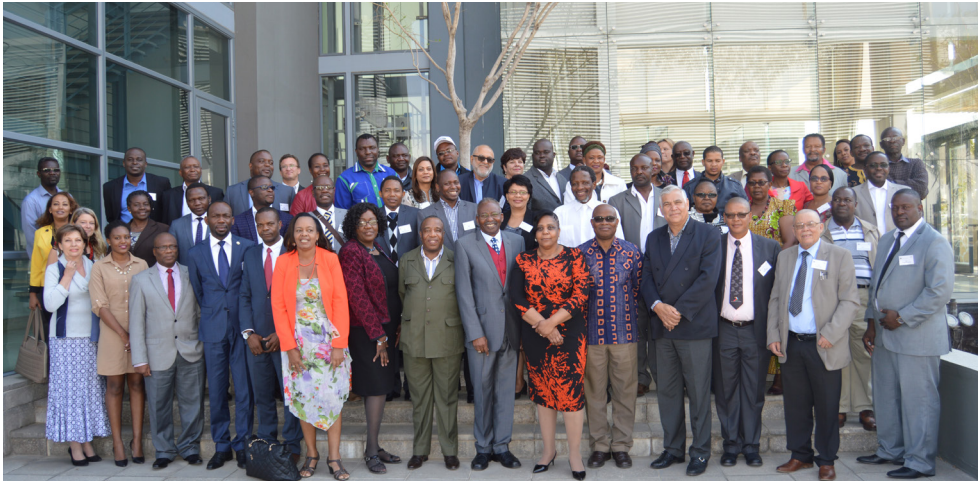
Participants at the Regional Policy Dialogue