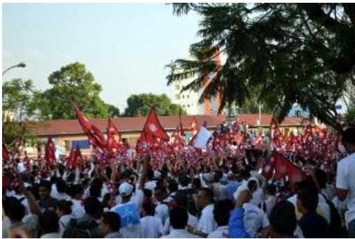
Rally leading up to deadline day in Nepal